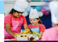
Base Camp Day