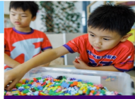
Base Camp Day

Visit campaustralia.com.au/rocketeers to join our next mission