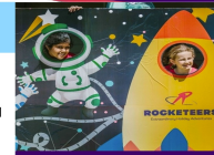
Base Camp Day